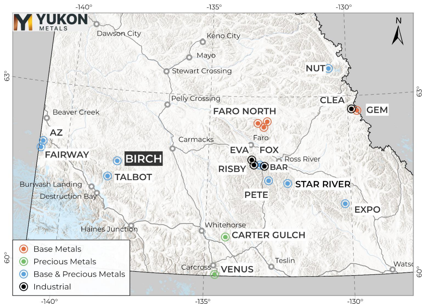
Figure 2- Birch Property Location Map.