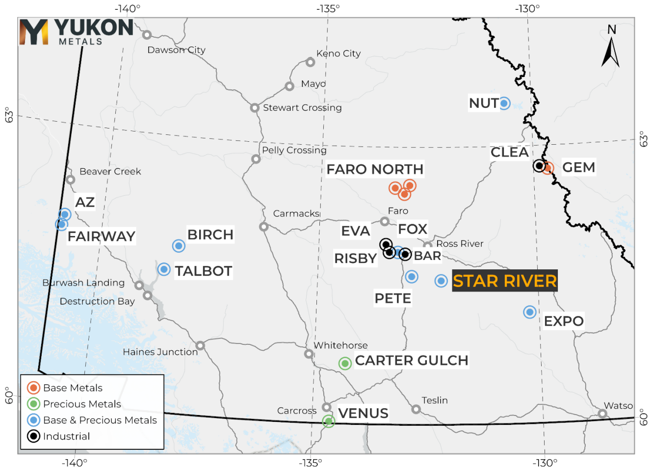
Figure 2- Star River Project Location Map